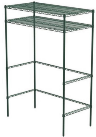
24x48 Docking Station