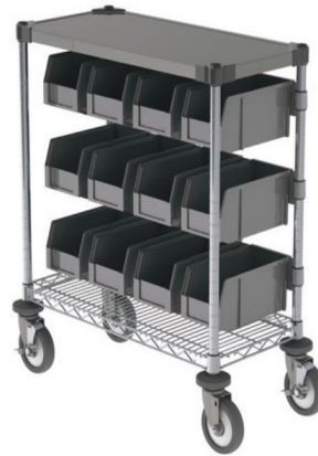
14x30 Condiment Cart