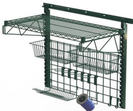
36" SmartWall Prep Unit