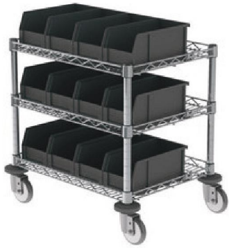
18x24 Undercounter Condiment Cart