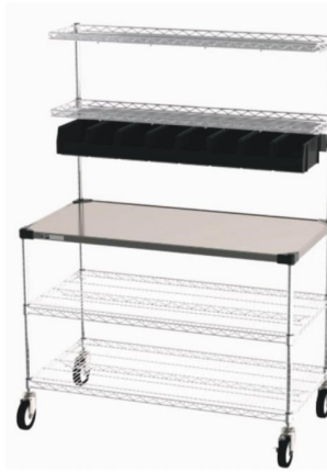
Large 24x48 Delivery Staging Station