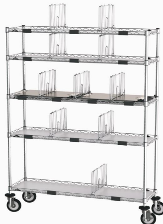
Curbside Pick Up and Staging Cart