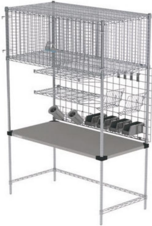
82x24x48 Manager's Office Station