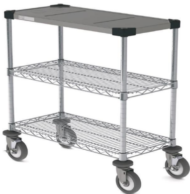
14x30 Drive Thru Order Staging