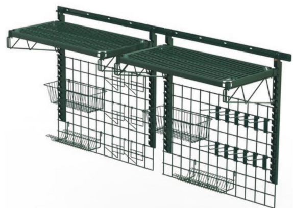
72" SmartWall Dish Tank Unit