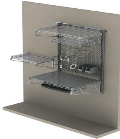
40" Smart Wall Manager's Station