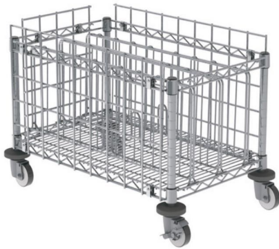
18x30 Under Counter Cup Storage