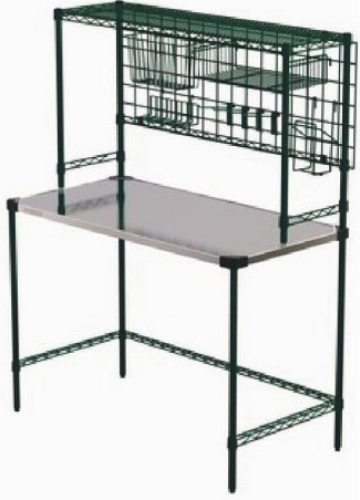
24x48 All-In-One Prep Table