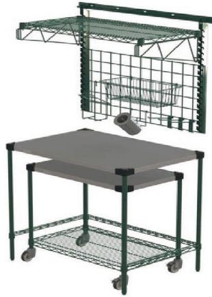
24x36 Prep Table with SmartWall