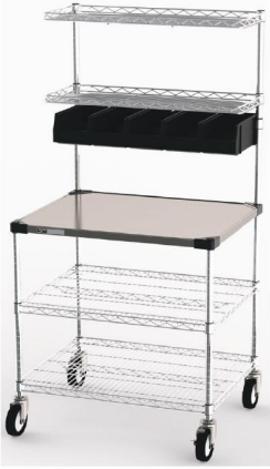
Small 24x30 Delivery Staging Station