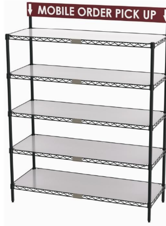
63x18x36 To-Go Order Pick-Up Station