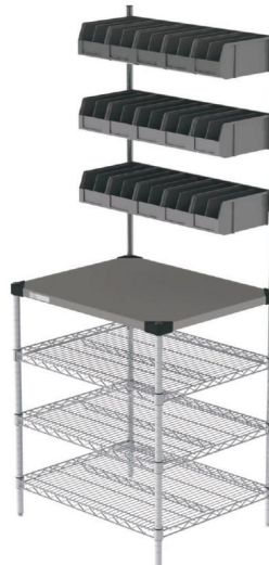
24x30 Drive Thru POS Table