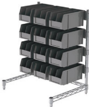
18x24 Countertop Condiment Tower