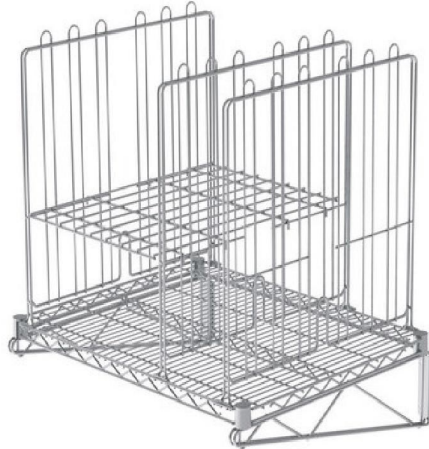
24x30 Overhead Storage Unit