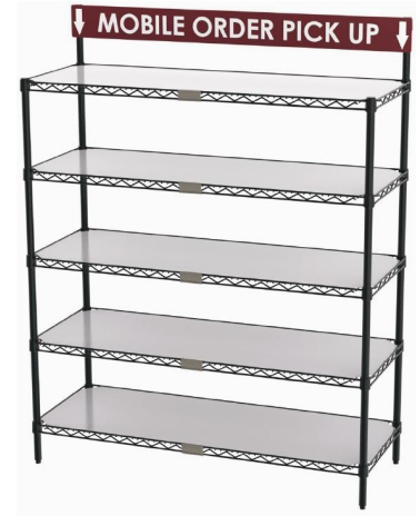
63x18x48 To-Go Order Pick-Up Station