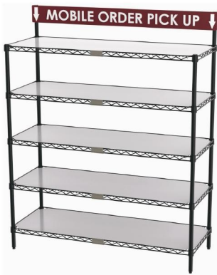
63x18x24 To-Go Order Pick-Up Station